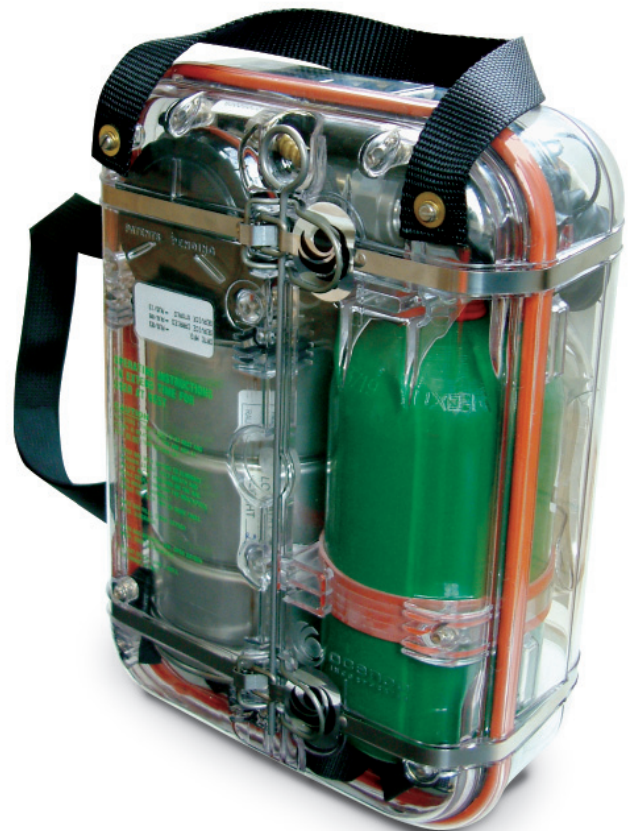
The EBA 6.5, in its clear, polycarbonate case, is durable and easy to inspect.

Easy to inspect – simple visual inspection confirms that unit is ready to use.