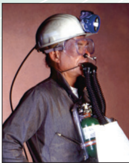
The EBA 6.5 can be donned in 15 seconds or less.

Since introducing the EBA 6.5, Ocenco Inc. has sold more emergency escape breathing apparatus to the worlds mining industry than all other manufacturers combined.